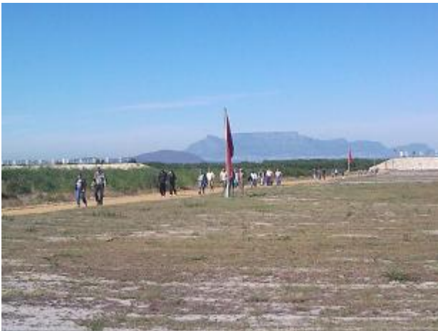
The long walk back on a perfect day.