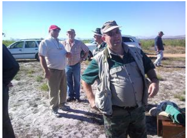
This must now end, I am hungry and thirsty!